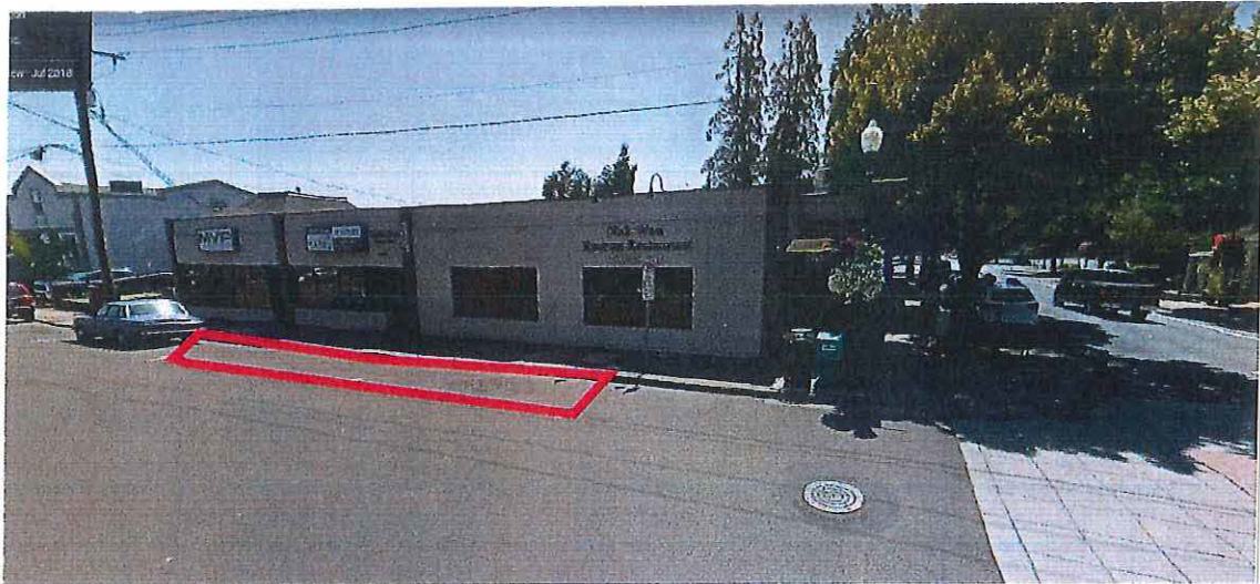
Location of the two spaces to be removed on SW 1 st Street east of Watson Avenue