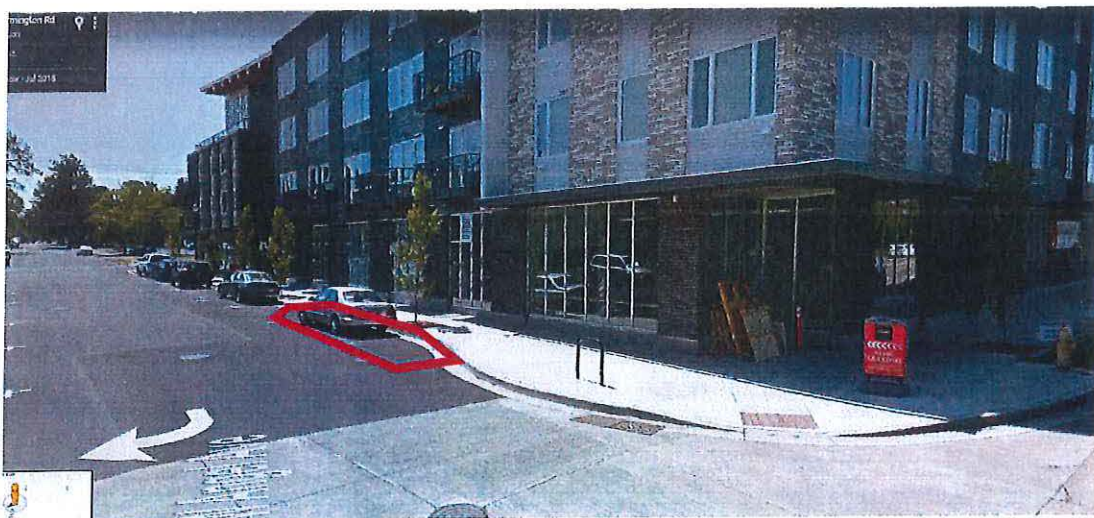
Location of the one parking stall to be removed on SW Angel Avenue south of Farmington Road