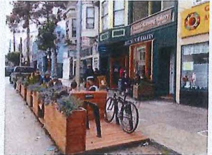
San Francisco, CA