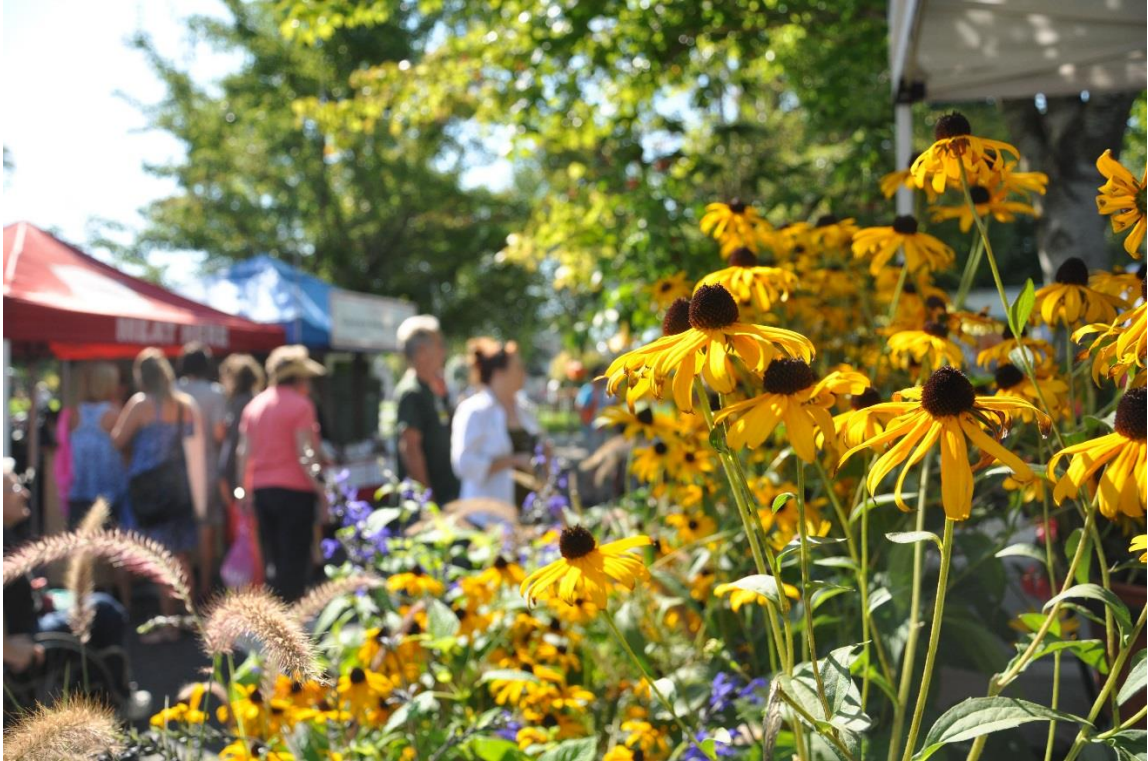
Beaverton Farmers Market