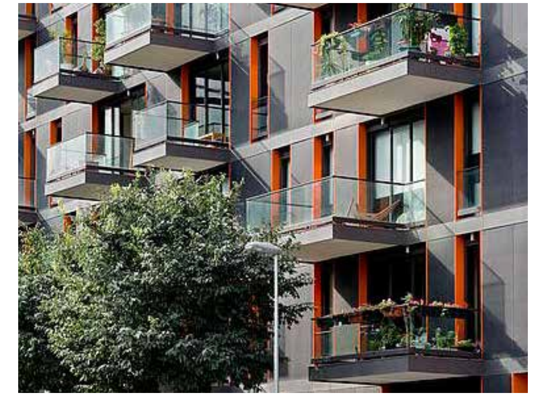
D Private open space (balcony)

Making Downtown even more vibrant. Modernizing city rules to reflect current trends and community interests allowed developments like the BG Food Cartel to become the regional draw it is today. This new set of proposed rules intends to encourage or allow even more places to gather with our friends, family, neighbors, and colleagues.