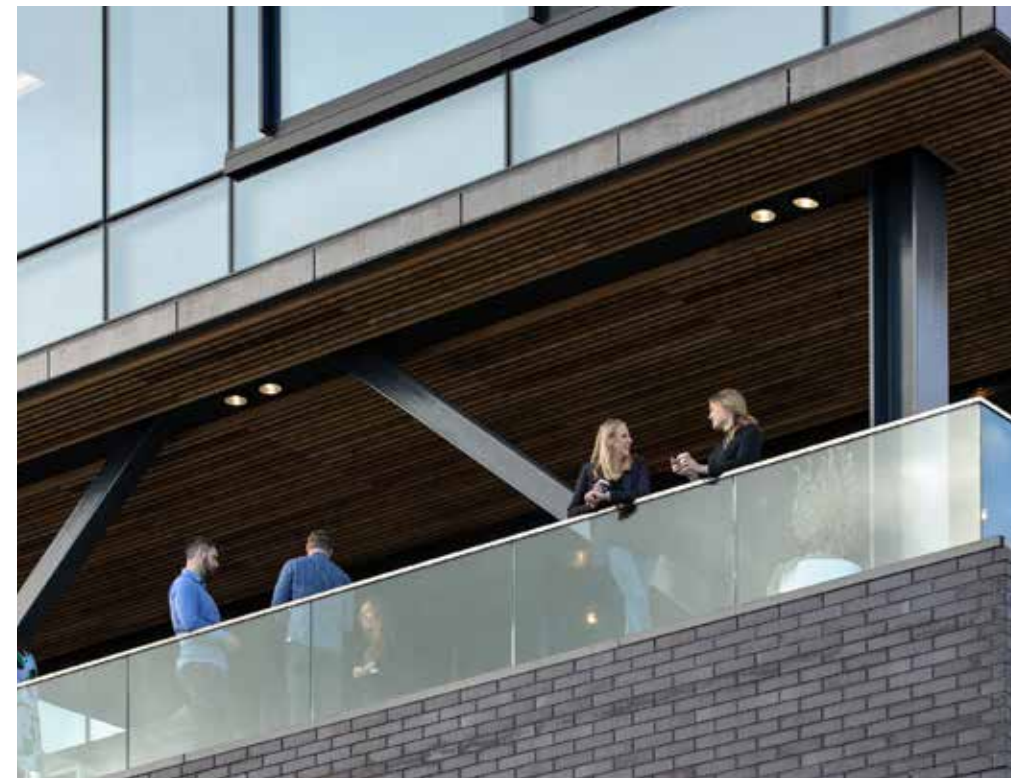
B Shared open space