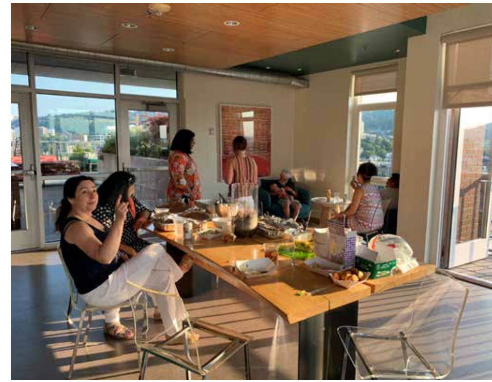
C Common community room