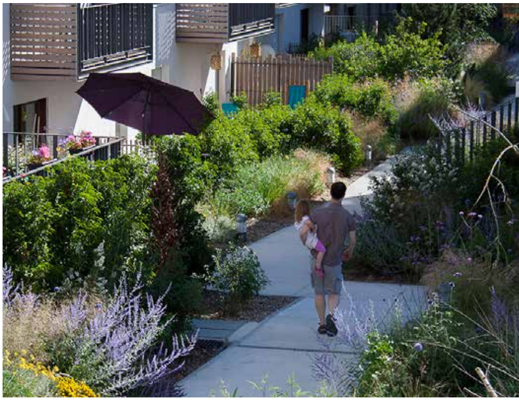
A Pedestrian path and courtyard