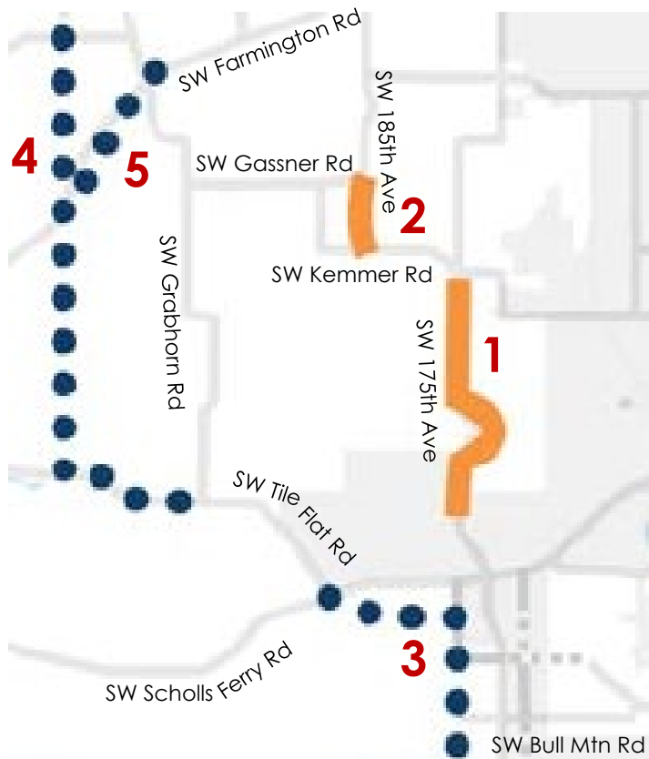
Figure 3. URTS Projects to be Further Studied