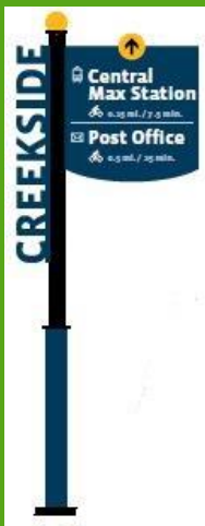
Advanced Directional for Vehicles and Bicycles