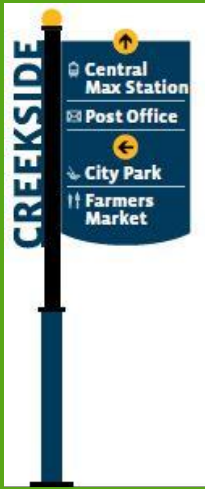
Advanced Vehicular Directional