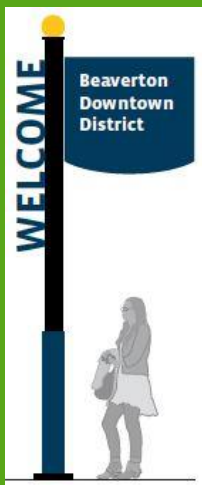
Entrance Identification Signage